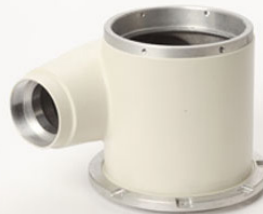
Machined Aluminum X-Ray Housing