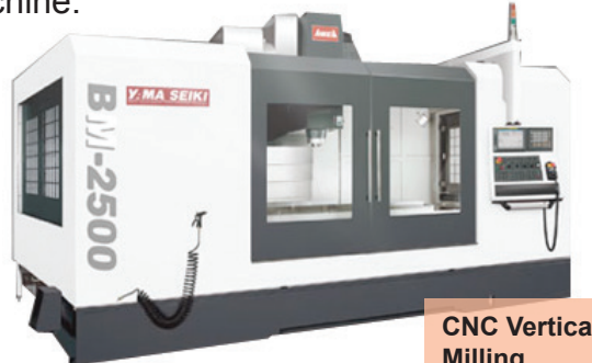
CNC Vertical Milling