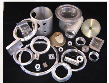
Machined Parts: Aluminum, Brass, Steel, Copper, Tungsten, Molybdenum