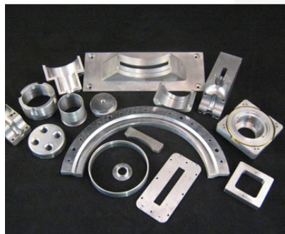
Lead Machined Parts