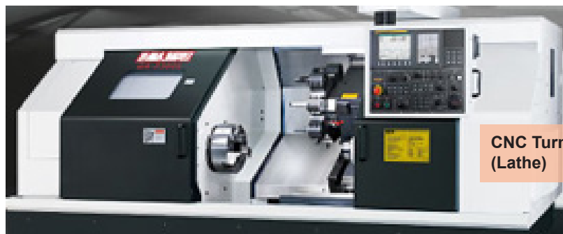
CNC Turning (Lathe)