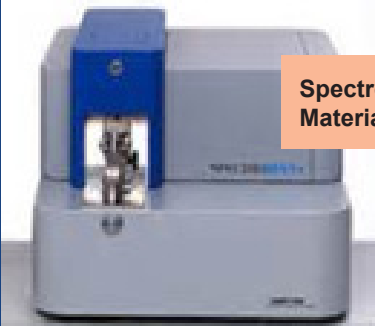
SpectroMax Material Analyzer