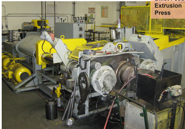
Billet Feed Extrusion Press

Vulcan can produce wire, tube, tape or any continuous profile through the extrusion process. In addition, Vulcan can provide billet for your extrusion department in any alloy you require and in any size needed. Through our extrusion department, we can supply any of your lead- and tin-based wire or tubing needs.